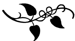
Art courtesy of Dover publications

28, It’s Only A Flesh Wound. Barony event in Jefferson, WI